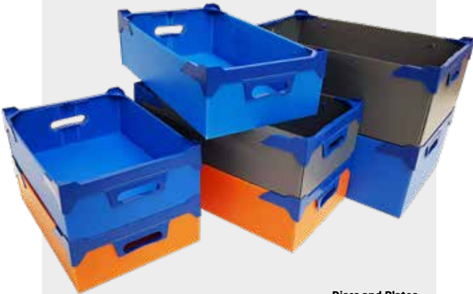
Discs and Plates Optimal protection with a anti-corrosion treatment (VCI)