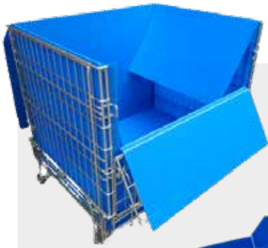
Rotation container An ideal cover for for containers made of steel wire for shuttle transports